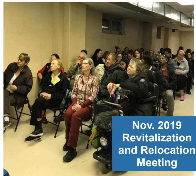
Nov. 2019 Revitalization and Relocation Meeting

Tenants are encouraged to review the documents in the package carefully, and to contact the relocation team or visit the Relocation Office located in the basement of 1555 Queen Street East if they have questions. Please note that all Don Summerville tenants now have fob access to 1555 Queen Street East.