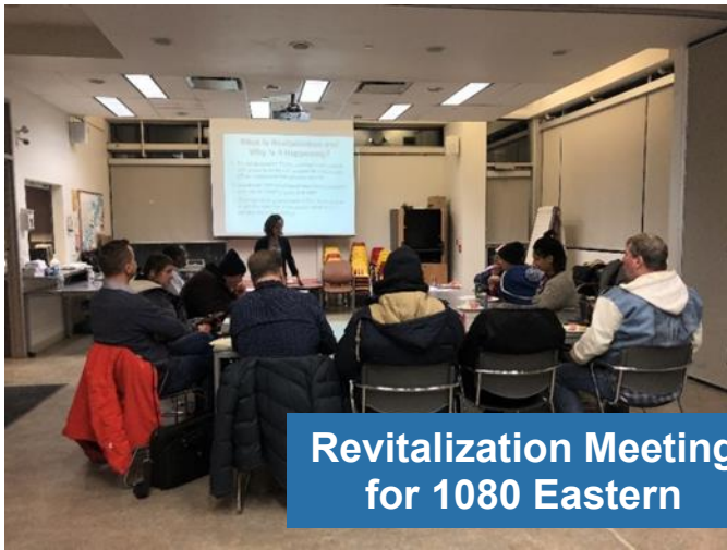
Revitalization Meeting for 1080 Eastern

Currently, tenants of 1080 Eastern Avenue have access to the Community Recreation Room located in the basement of 1555 Queen Street East.